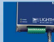
Screw Terminal Connector