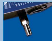
Barbed Vacuum Connector