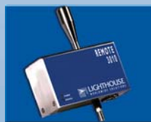
Stainless Steel Enclosure